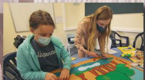
Children from Oratia Primary School preparing animation artwork